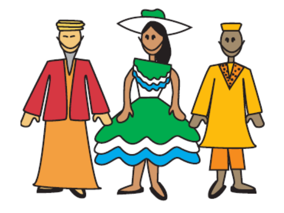
Jesus? – Who is that? The last THREE people (30%) have virtually no access to the gospel.

Jesus? – No thank you. FOUR people (40%) have some access to the gospel, but they have not yet responded.